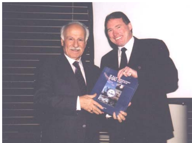
Dr. Assad Kotaite, President of the ICAO Council is presented with a copy of the International Standard for Business Aircraft Operations (IS-BAO) by Donald Spruston, Director General IBAC, at the June Air Navigation Commission—Industry meeting. See page 4.

(specifically non-commercial aircraft with MTOW greater than 5,700 kgs) and Airports. The proposals for amending Annex 17 will be considered by the ICAO Council in 2003. See pg.3 for a summary of the proposed changes to the Standards and Recommended Practices. Details of the proposals can be found on the IBAC website at < www.ibac.org >