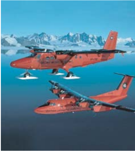
BAS aircraft over Antarctica

IS-BAO attracts many diverse organizations but a few are unique. The British Antarctica Survey operates aircraft in one of the most hostile environments in the world, at the bottom of the world. The BAS aircraft fleet consists of four De Havilland Canada Twin Otters and one De Havilland Canada Dash-7, all Bermuda registered. These aircraft operate in support of a variety of environmental, scientific and biological research projects. For more information about this operation and their activities, see www.antarctica.ac.uk .